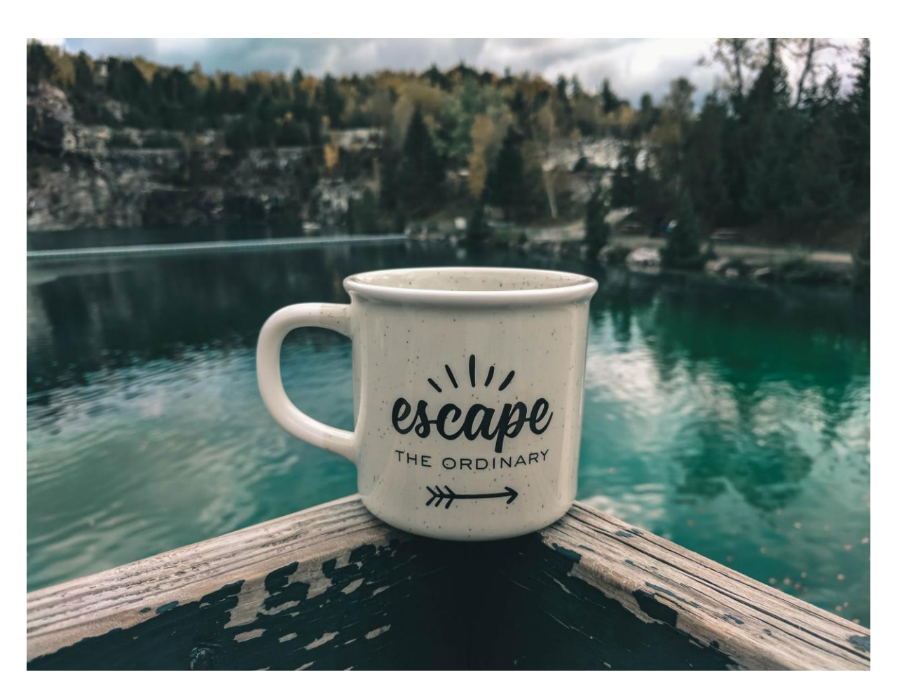
Escape Rooms in Education: Your guides to freedom